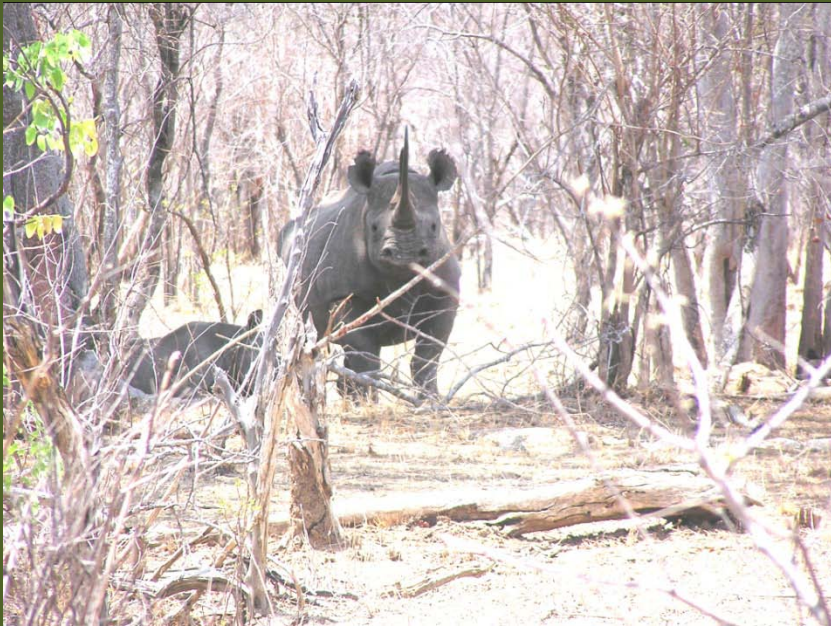
Jenny December 2005