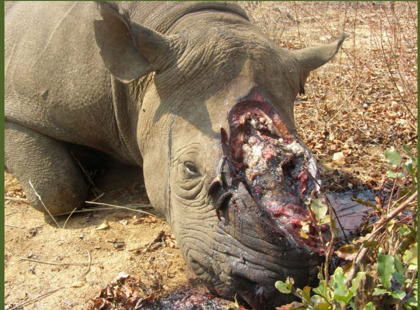
Jenny September 2009