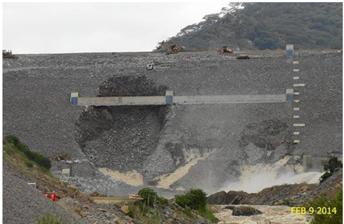
Disater ... Tokwe Mukorsi Dam Wall close to collapse