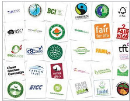
Identify voluntary sustainability standards which operate in your line of business