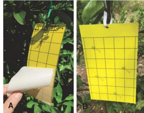
Figure 1. Sticky traps for monitoring of ACP: (A) Chempac Yellow Sticky trap and (B) Lime-green ACP trap (Alpha Scents, USA)