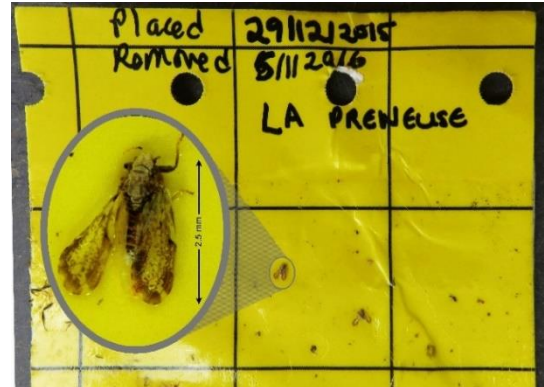
Figure 4. ACP adult on yellow sticky trap. Adult ACP recognised by its brown body and brown mottled wings with an interrupted band on the apex