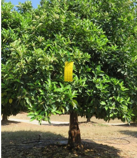
Figuur 2. Geel kleeflokval aan die buitenste lowerdak van 'n sitrusboom

blare rondom die lokval. Verwyder die waspapier wat die geel kleefkaart bedek.