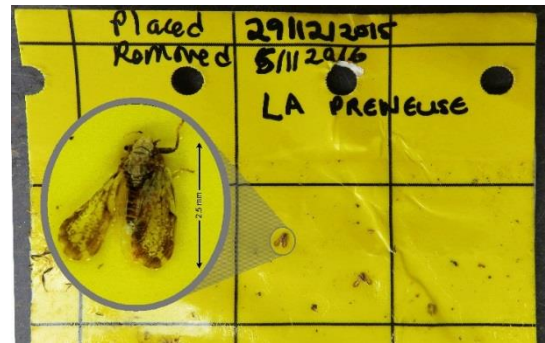
Figuur 4. ACP volwassene op geel kleeflokval. Volwasse ACP uitgekken aan sy bruin liggaam en bruin gespikkelde vlerke met 'n onderbroke band op die punt