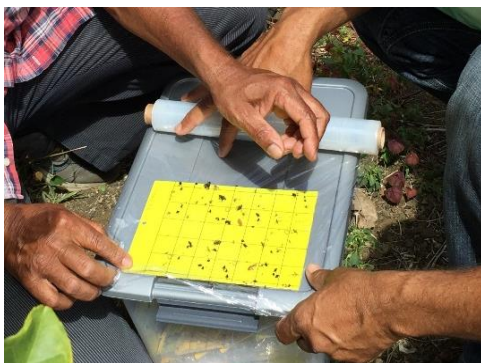
Figuur 3. Bedekking van die kleef oppervlakte van die lokval met deursigtige film