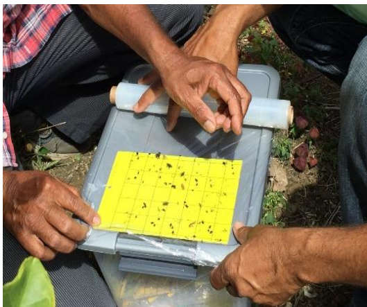
Figure 3. Covering of sticky surfaces of the trap with transparent film