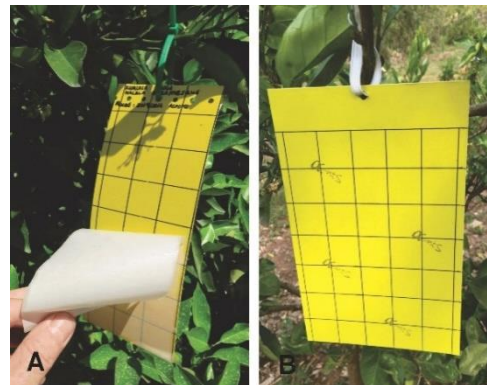
Figuur 1. Kleef lokvalle vir monitering van ACP: (A) Chempac Geel KleefLokval en (B) Lemmetjie-groen ACP lokval (Alpha Scents, VSA)