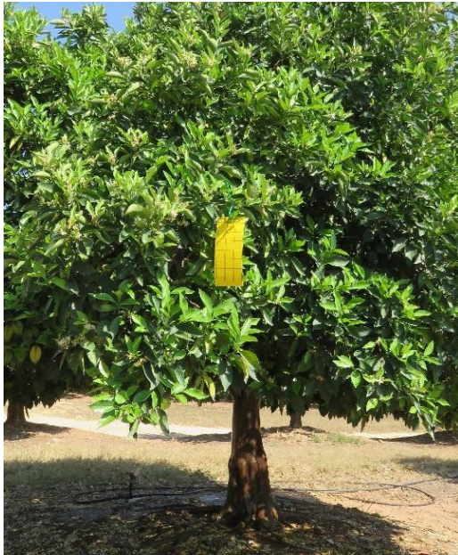
Figure 2. Yellow sticky trap on the outside canopy of a citrus tree