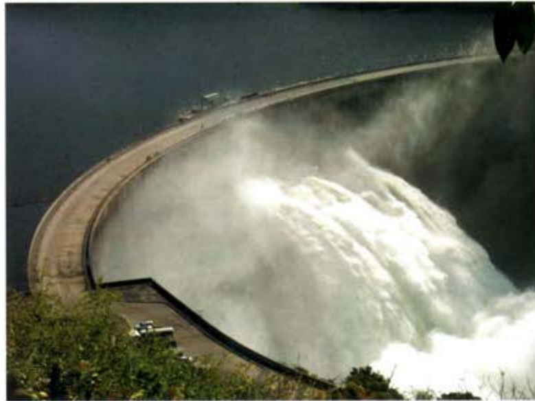
Table 11: Investment Opportunities in Dam Construction