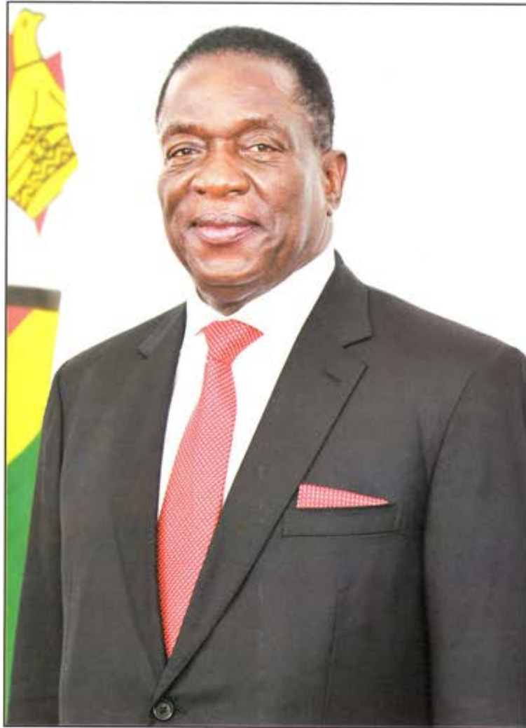
His Excellency Emmerson Dambudzo Mnangagwa President Of The Republic Of Zimbabwe