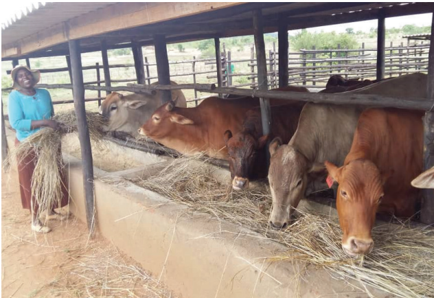
Targeting small to medium scale beef cattle farmers, BEST will improve the economic, social and environmental performance of beef value chain in Zimbabwe.

The Beef Enterprise Strengthening and Transformation (BEST) project is being implemented in five provinces of Zimbabwe (see map below). World Vision is partnering with Welthungerhilfe (WHH), Sustainable Agriculture Technology (SAT), Livestock and Meat Advisory Council (LMAC) and Zimbabwe Agricultural Development Trust (ZADT). The project seeks to create a robust, competitive beef value chain that promotes enhanced trade, employment creation, food security, and inclusive green economic growth by 2023 for 25,000 small to medium as well as commercial cattle farmers.