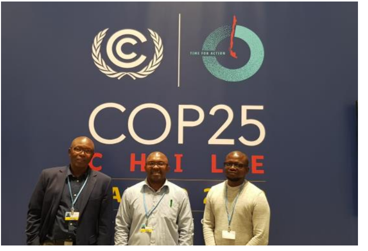
CEO, Policy Advisor and young farmer from Botswana at COP25

Towards addressing this gap, the 25th Conference of Parties to the United Nations Framework Convention on Climate Change (COP25), held in December 2019, took the progressive step of introducing a Farmers' Day. This was a highlight of the COP25 programme for SACAU and partners, bringing together farming groups, researchers, civil society, and other advocates to share perspectives on climate neutral and carbon smart farming, agroecology