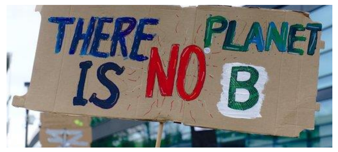
No planet B. No plan B. Ignoring climate change is no longer an option.

Nations Framework Convention on Climate Change (UNFCCC) ended on a rather low note after two weeks of negotiations. The event was held in Madrid, Spain.