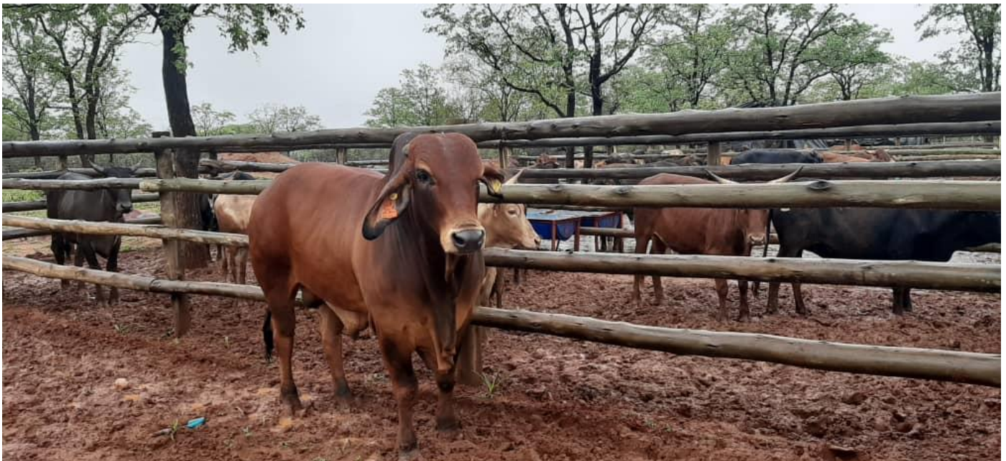
One of the strategic pillars of the BEST project is breed improvement. Through private sector partnerships, small holder beef producers now have access to bulling services for a fee at the Cattle Business Centres (CBCs). Bulling services are now on offer at the Lapache CBC in Mwenezi district.