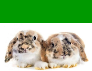
English Lop Rabbit