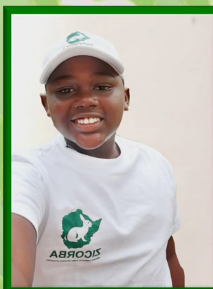
Deloitte Moyo Youth Ambassador Bulawayo