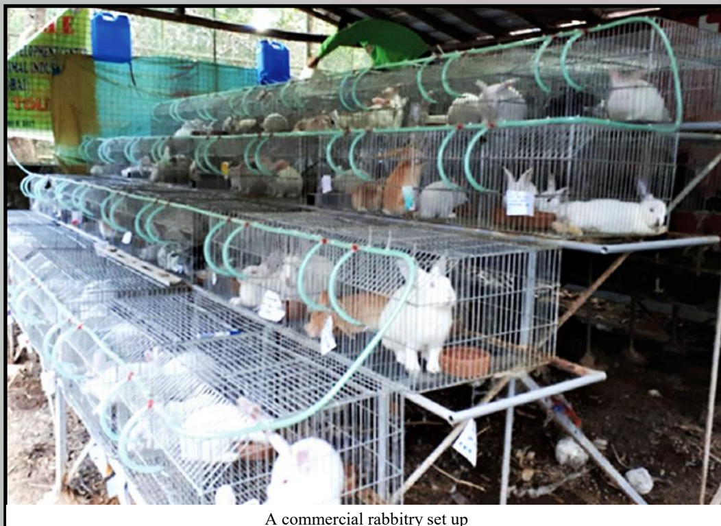
A commercial rabbitry set up

Mostly online. From the start, I would post online that I had chickens and rabbit for sale, gradually growing my trade's prominence