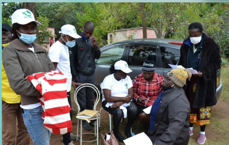
Team ZICORBA assisting potential members to fill in registration forms in Masvingo