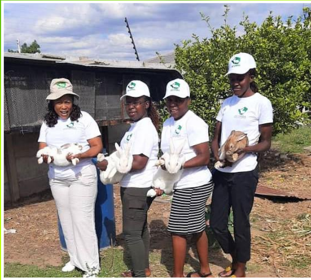
Ladies from Harare province chapter pose with their rabbits