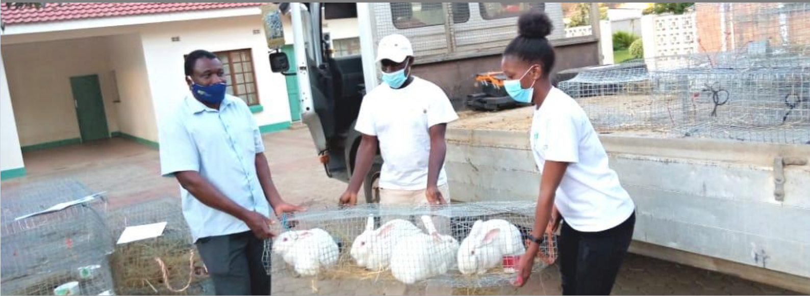
ZICORBA members in Bulawayo , receiving New Zealand White pure breeds donated by Raymeg Consultants Private Limited

Z ICORBA members based in Bulawayo and Manicaland provinces have received New Zealand White and Chinchilla Giganta pure rabbit breeds, respectively, from rabbit firm Raymeg Consultants Private Limited.