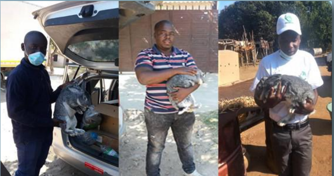
ZICORBA members in Manicaland, with their Chinchilla Giganta pure breeds donated by Raymeg Consultants Private Limited

ZICORBA, which is the only collective voice of rabbit farmers in Zimbabwe, is engaging schools, hospitals, hotels, restaurants and eateries in its nationwide campaign to popularise consumption of rabbit meat, because of its immense health benefits.